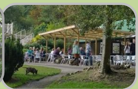
L-R Monuments to Thomas Boulsover in Tudor Square and near Wiremill Dam, Shepherd Wheel and Forge Dam Cafe