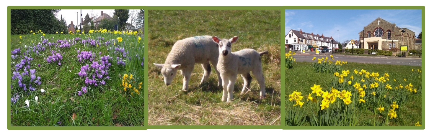
A community church sharing the love of Jesus