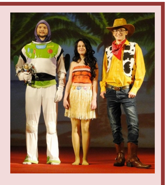
Buzz Lightyear, Moana and Woody

A big thank you to the 100+ children and adults who worked so hard to bring this amazing and entertaining journey to life before our enraptured eyes.