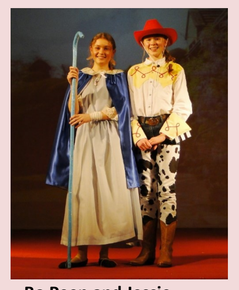
Bo Peep and Jessie