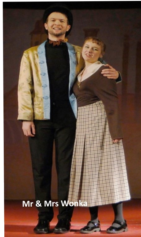
Mr & Mrs Wonka