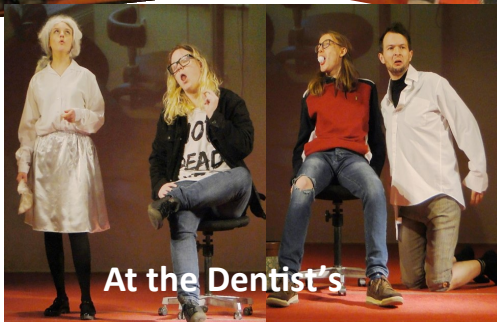
At the Dentist's