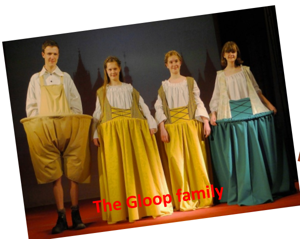
The Gloop family