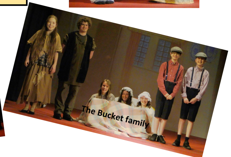
The Bucket family