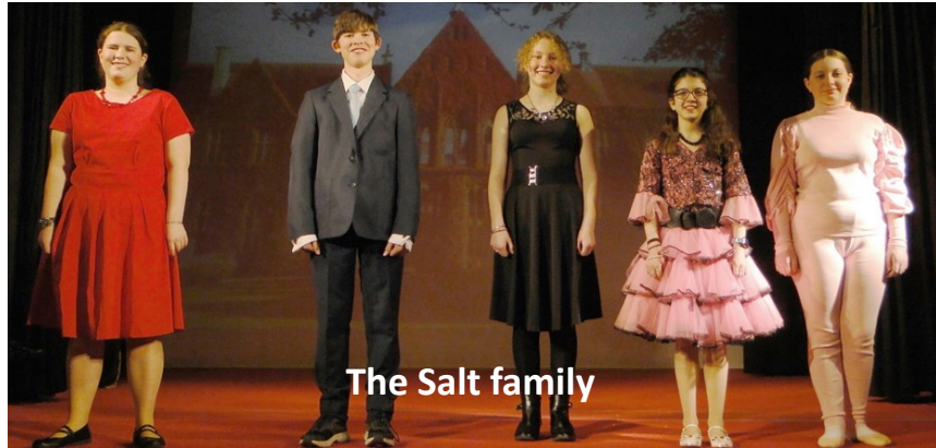
The Salt family