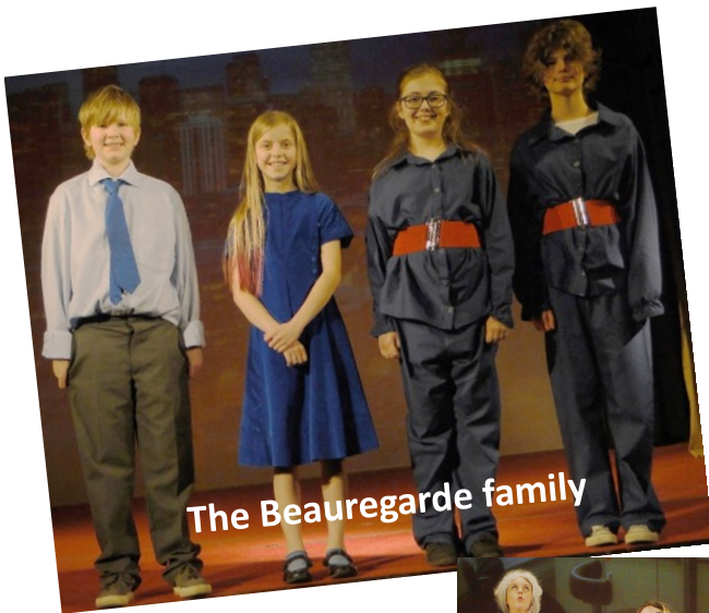
The Beauregarde family