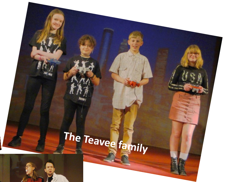
The Teavee family